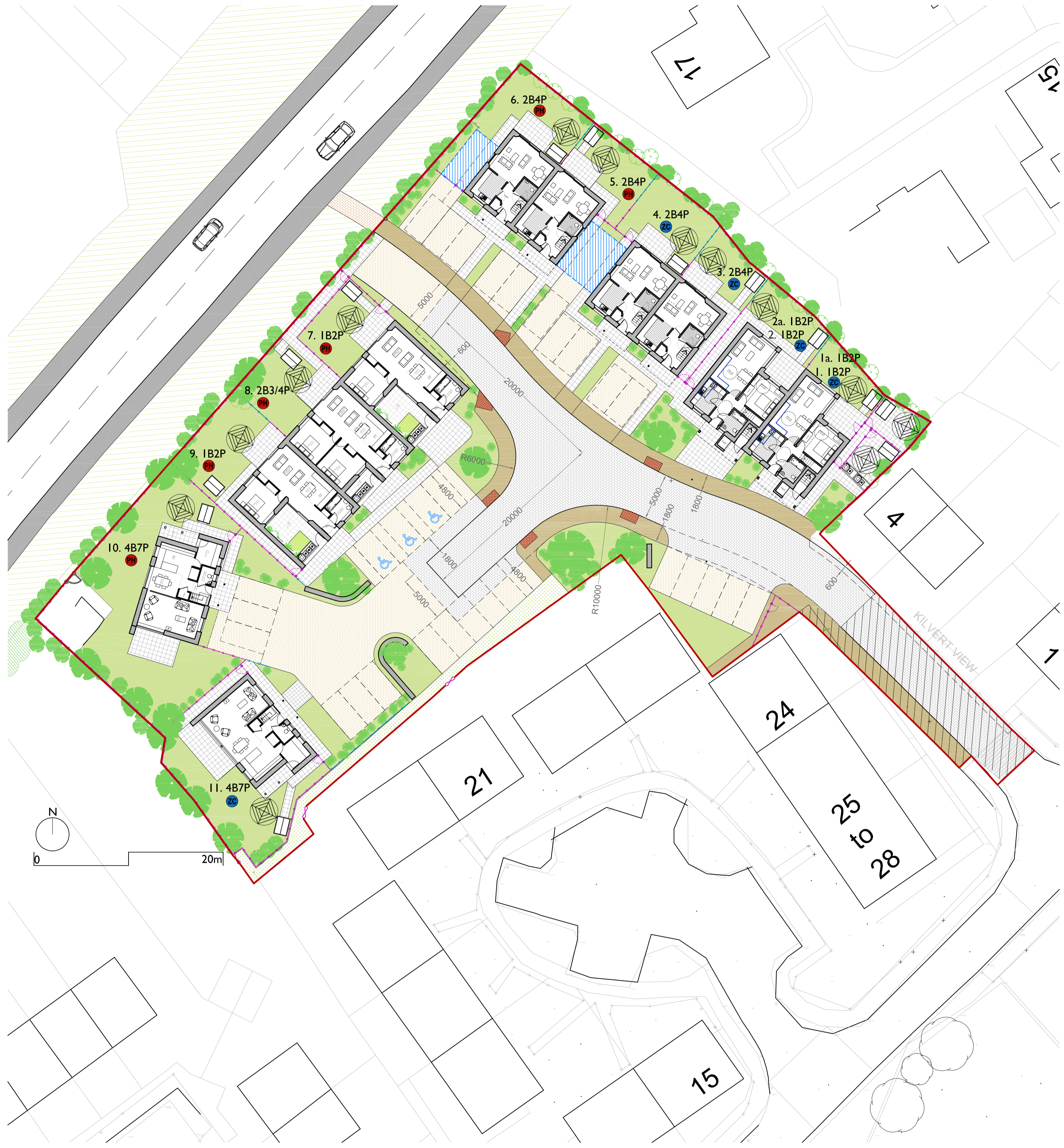
CYNLLUN SAFLE SITE PLAN - 1:200 @ A1