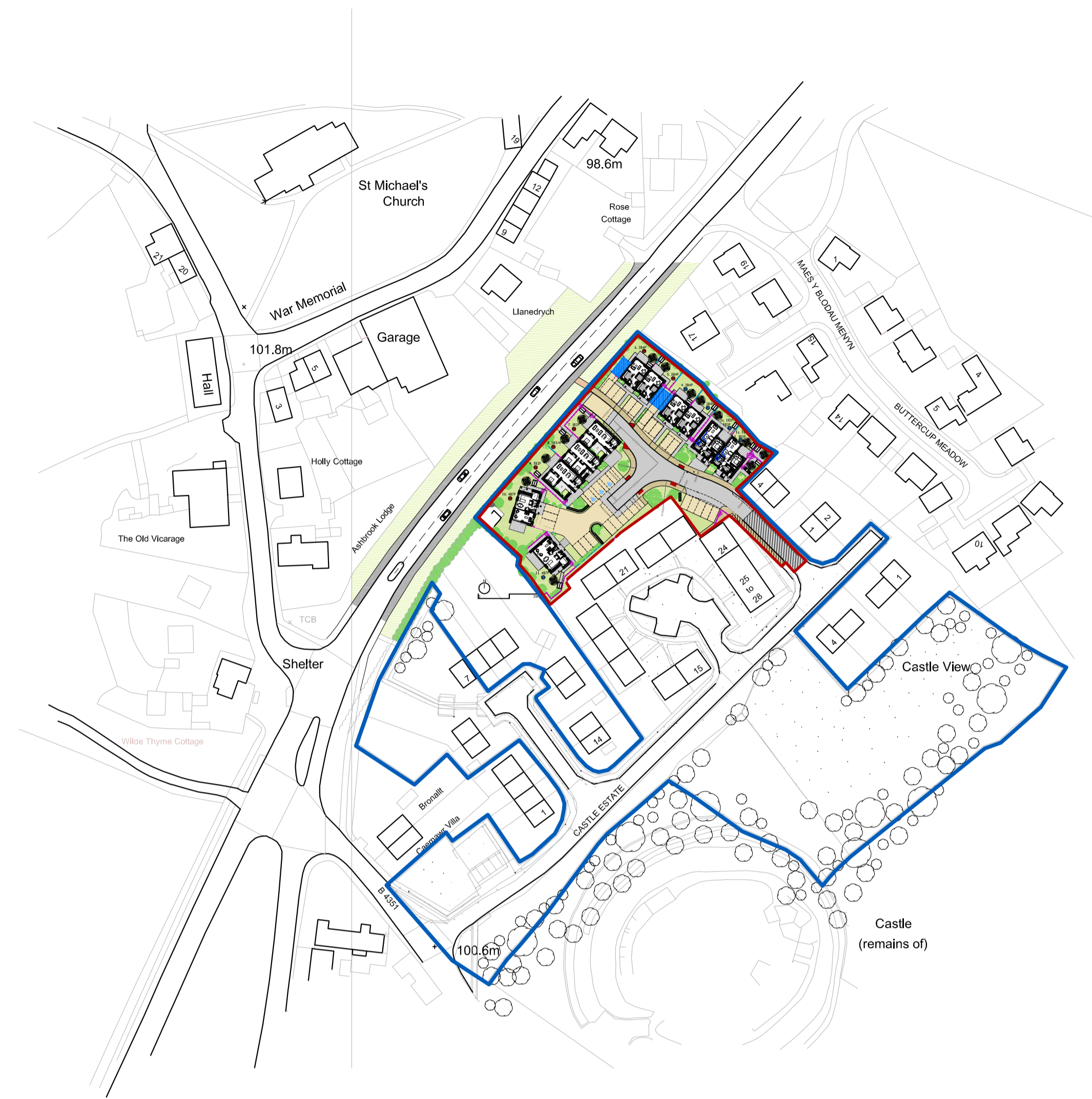
CYNLLUN LLEOLIAD LOCATION PLAN - 1:1250 @ A1